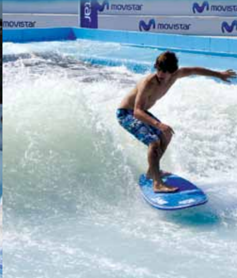
DEEP WATER STANDING WAVE