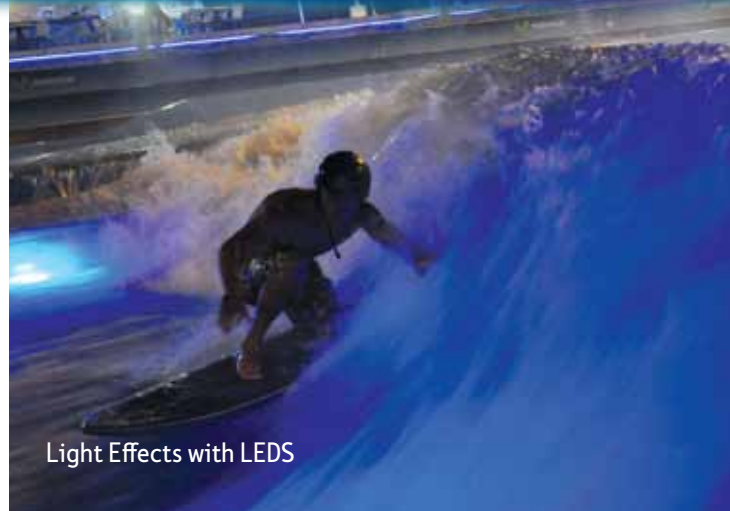
Light Effects with LEDs