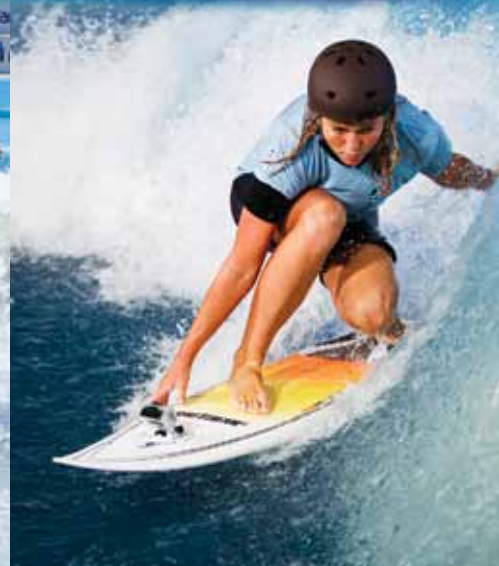
LEFT OR RIGHT BARRELING WAVE