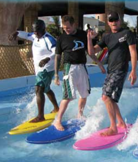
SURF TRAINING WAVE