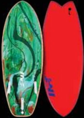
Standard 4'11" Black Ball Beater